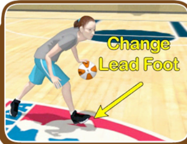
Change Lead Foot

Keep dribble close to body and around knee level.